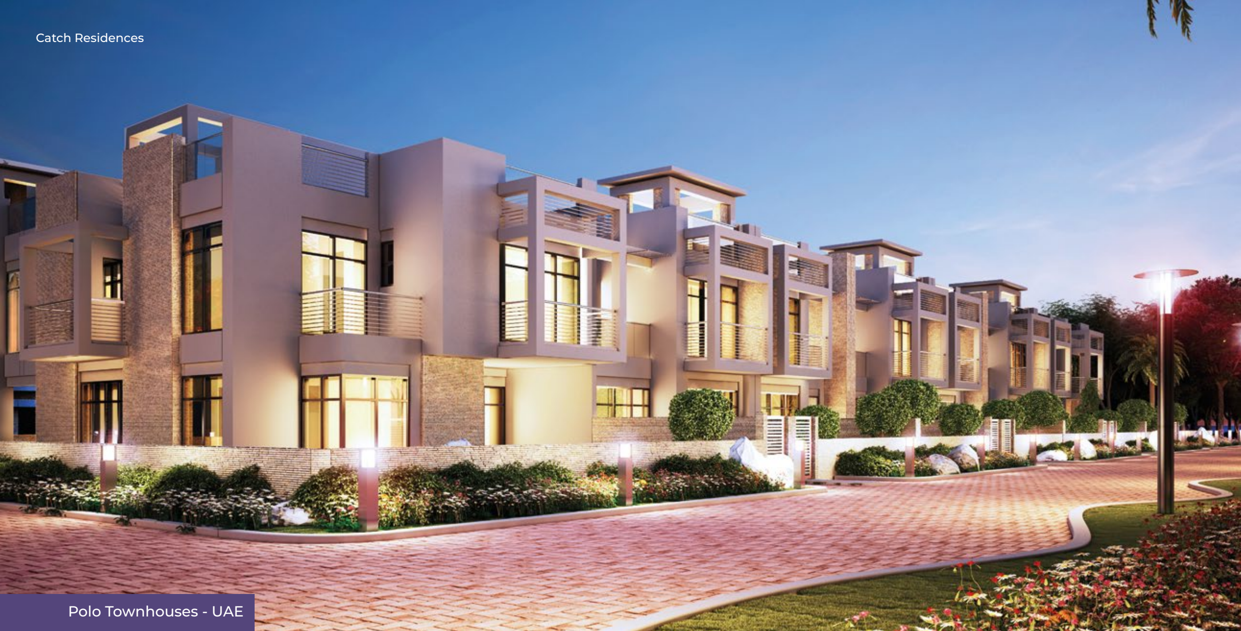
Polo Townhouses - UAE