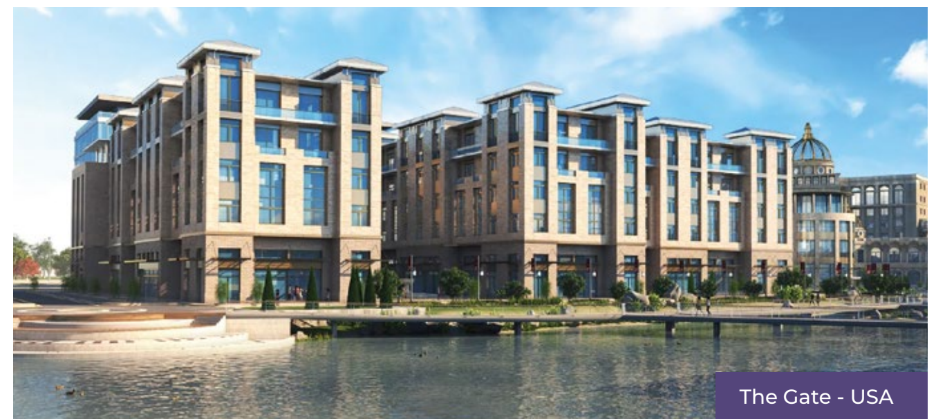
The Gate - USA

Today, an expanded and impressive portfolio of premium properties, which includes some of the most sought-after properties by meticulous clients worldwide, serve as a testament to IGO's well-deserved reputation as one of the top regional investment companies.