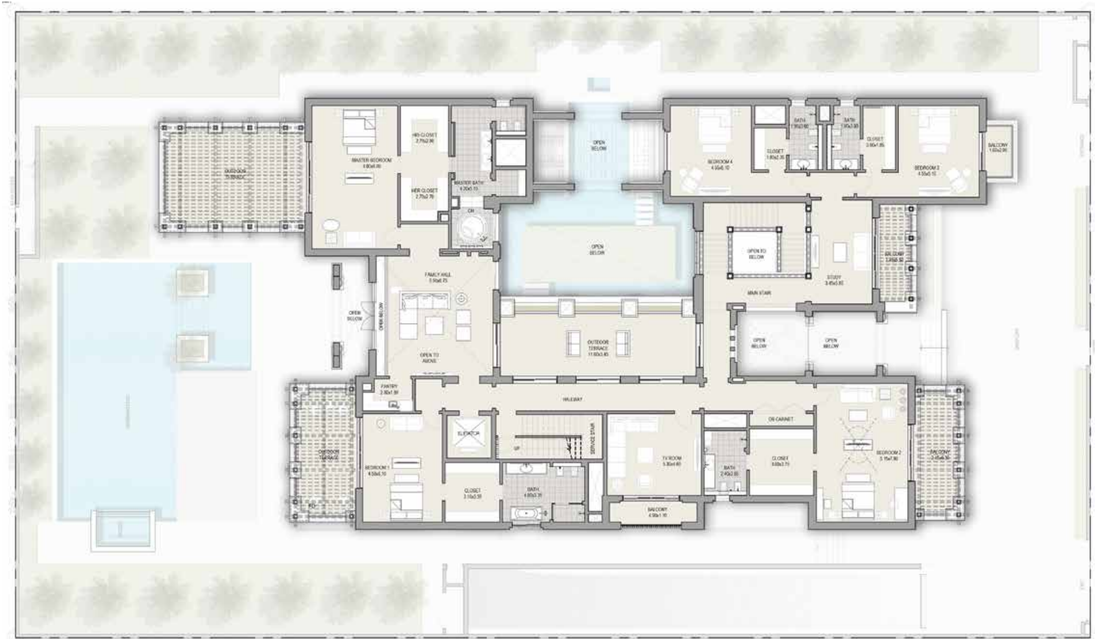
FIRST FLOOR TOTAL AREA 26,409 SQFT