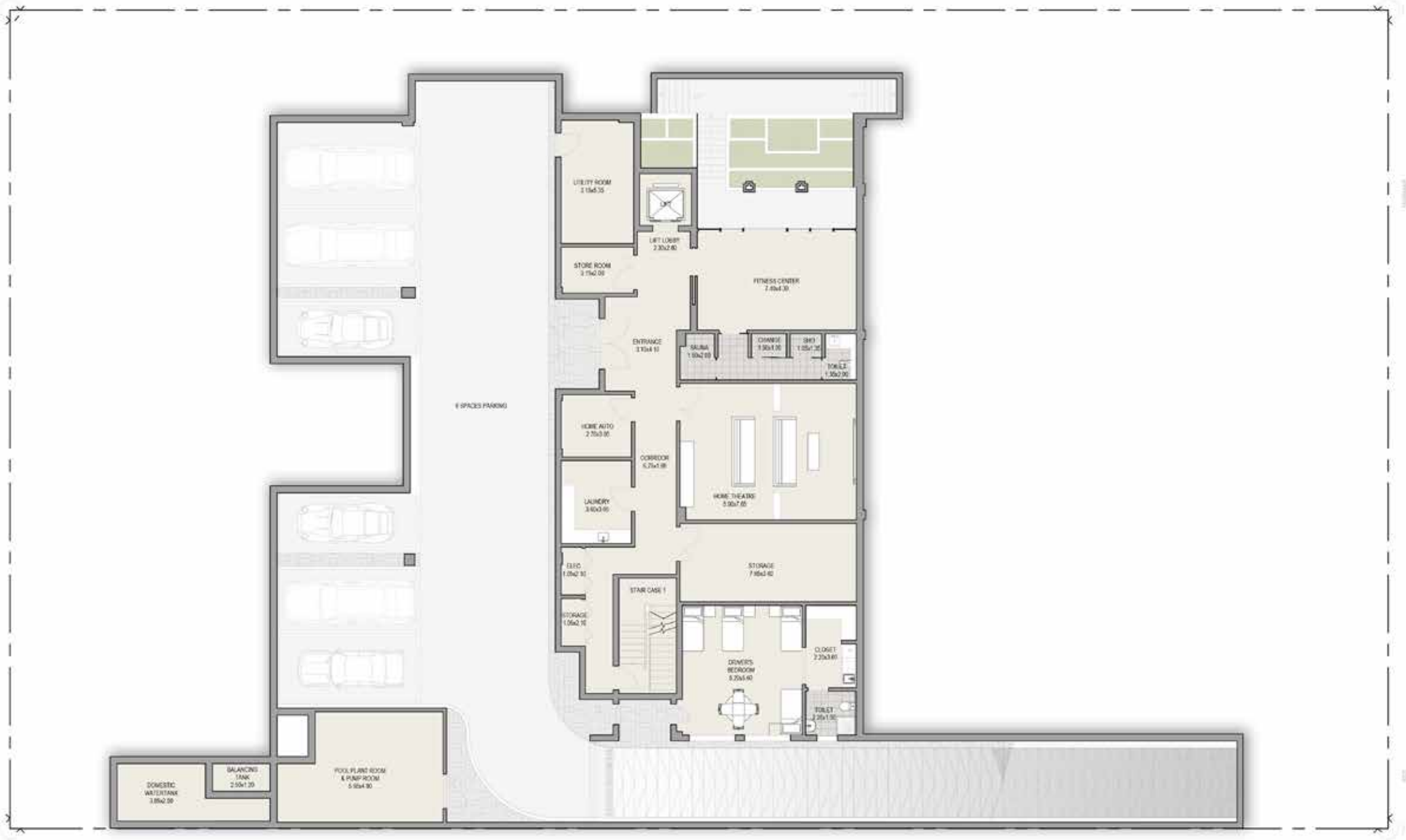
BASEMENT FLOOR TOTAL AREA 25,871 SQFT