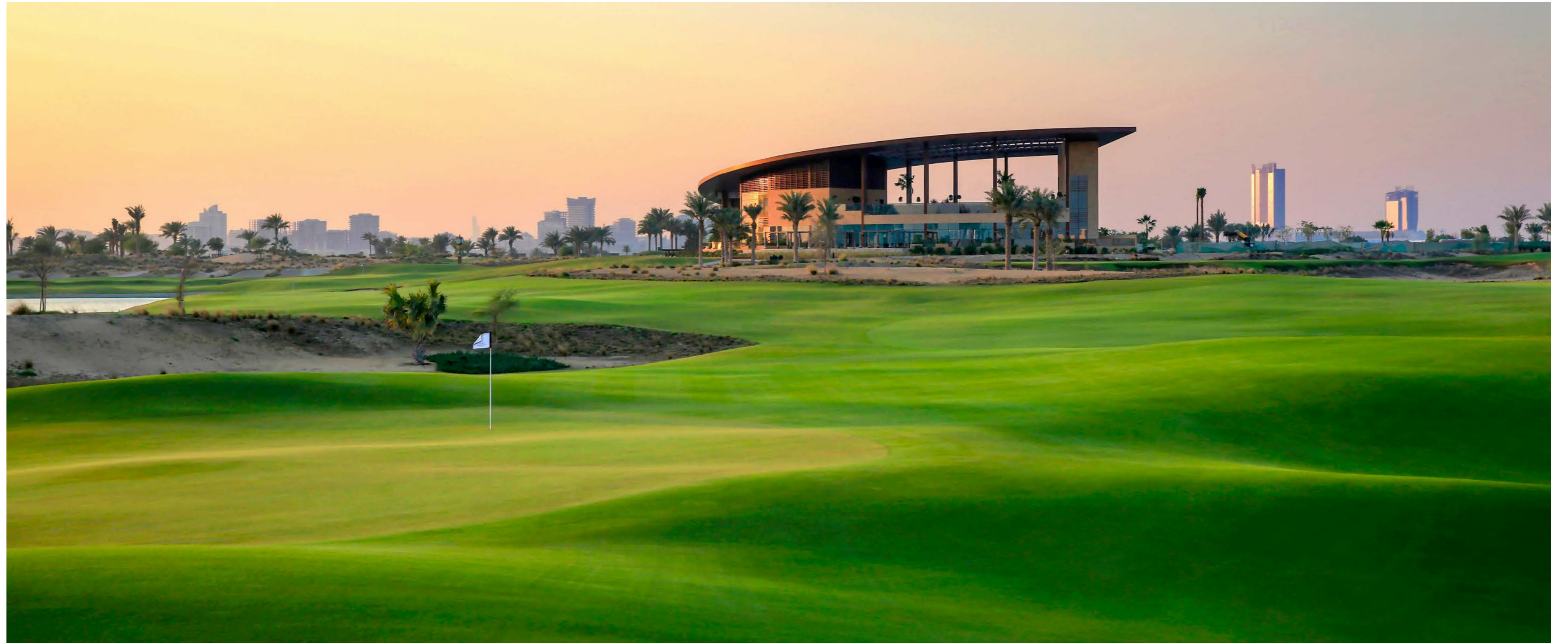
Trump International Golf Club Dubai