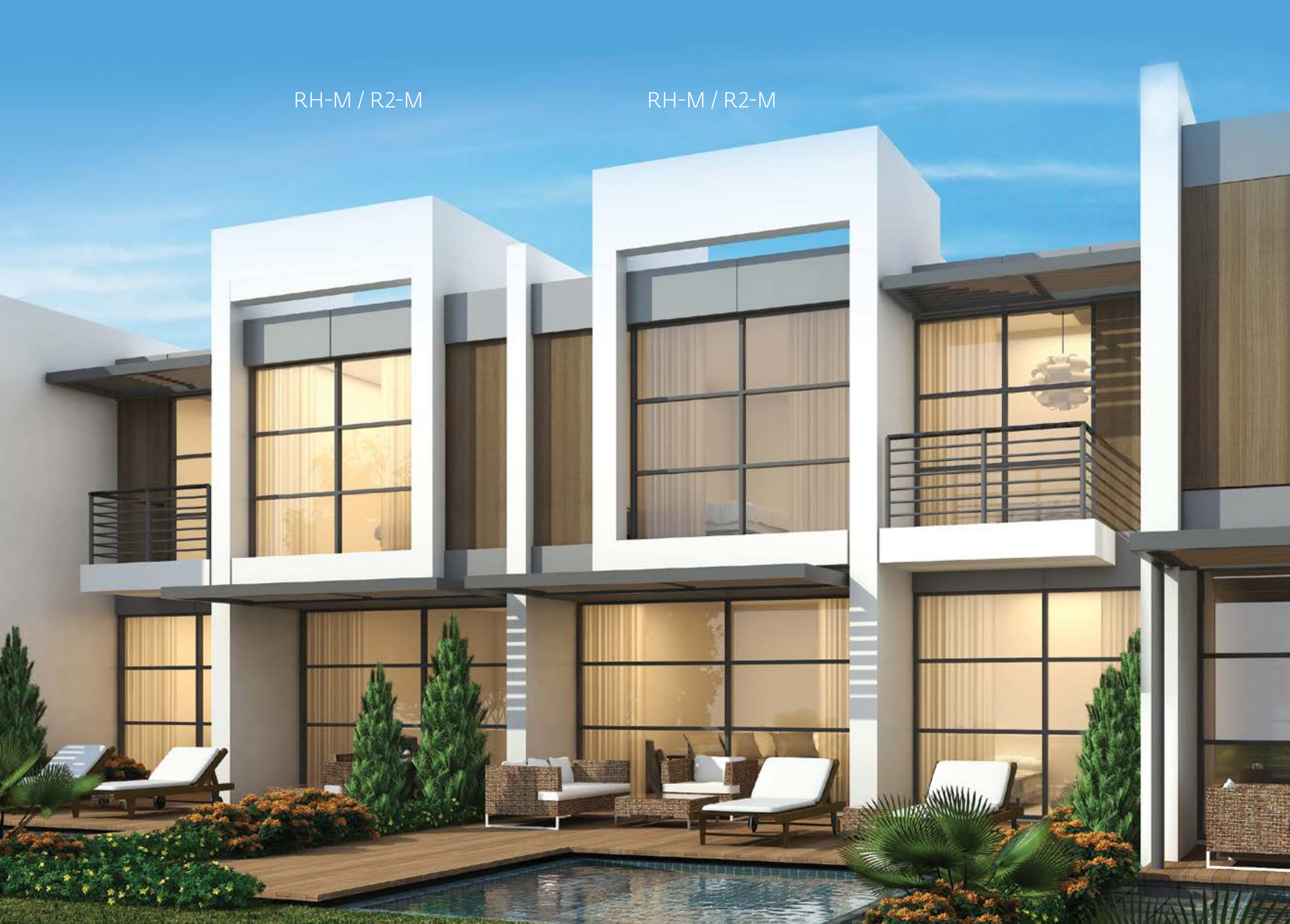
RH-M / R2-M