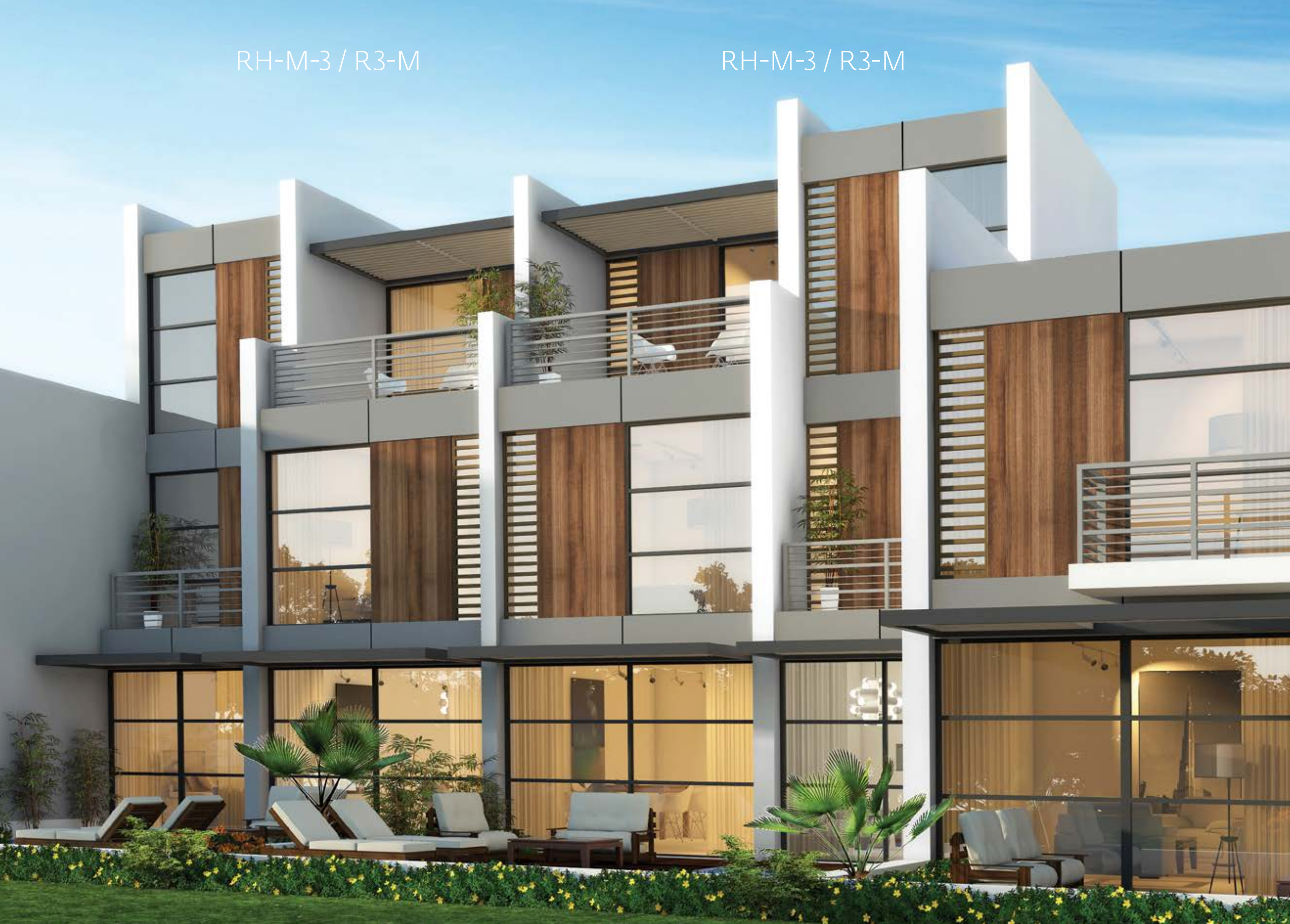
RH-M-3 / R3-M