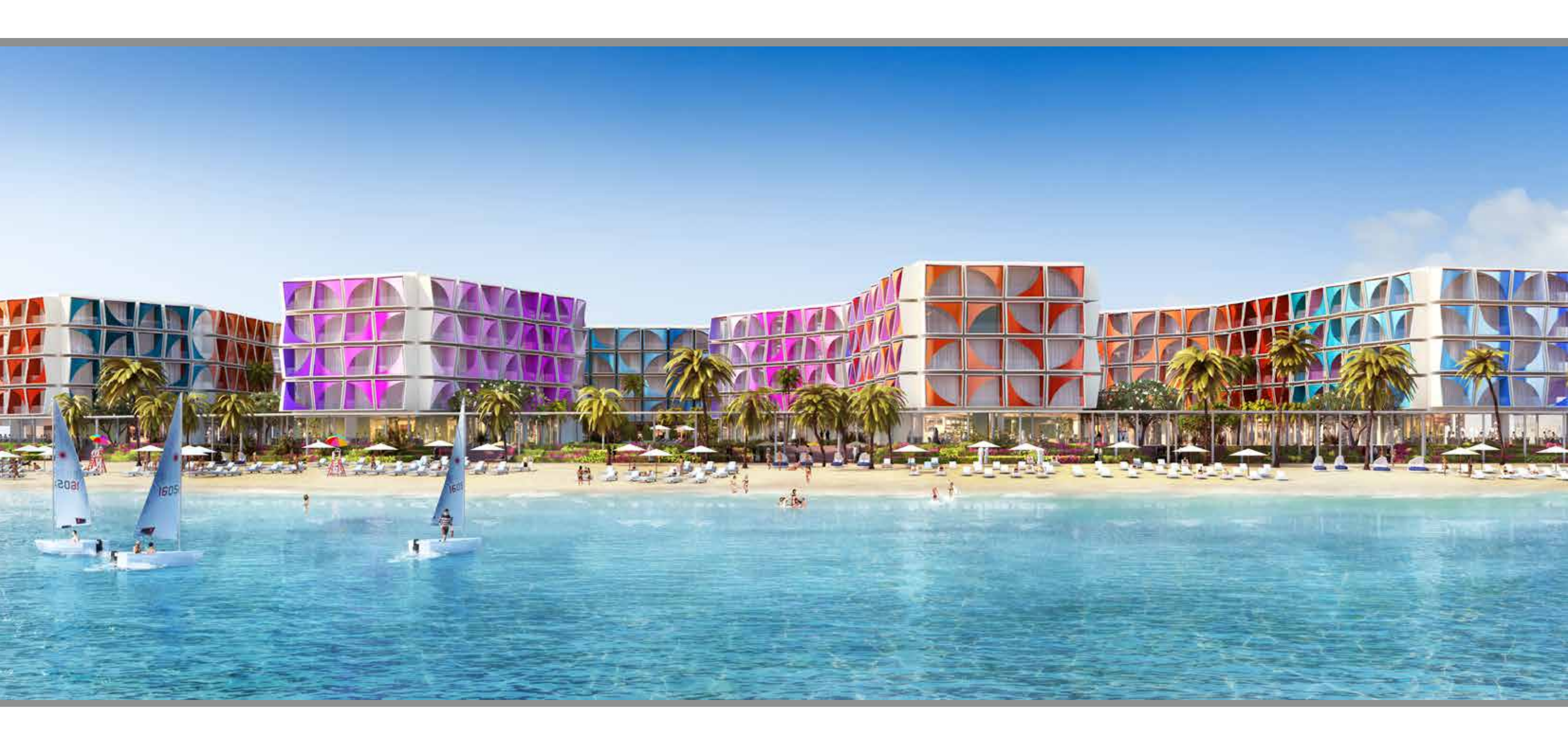
THE CÔTE D'AZUR — HOTEL —