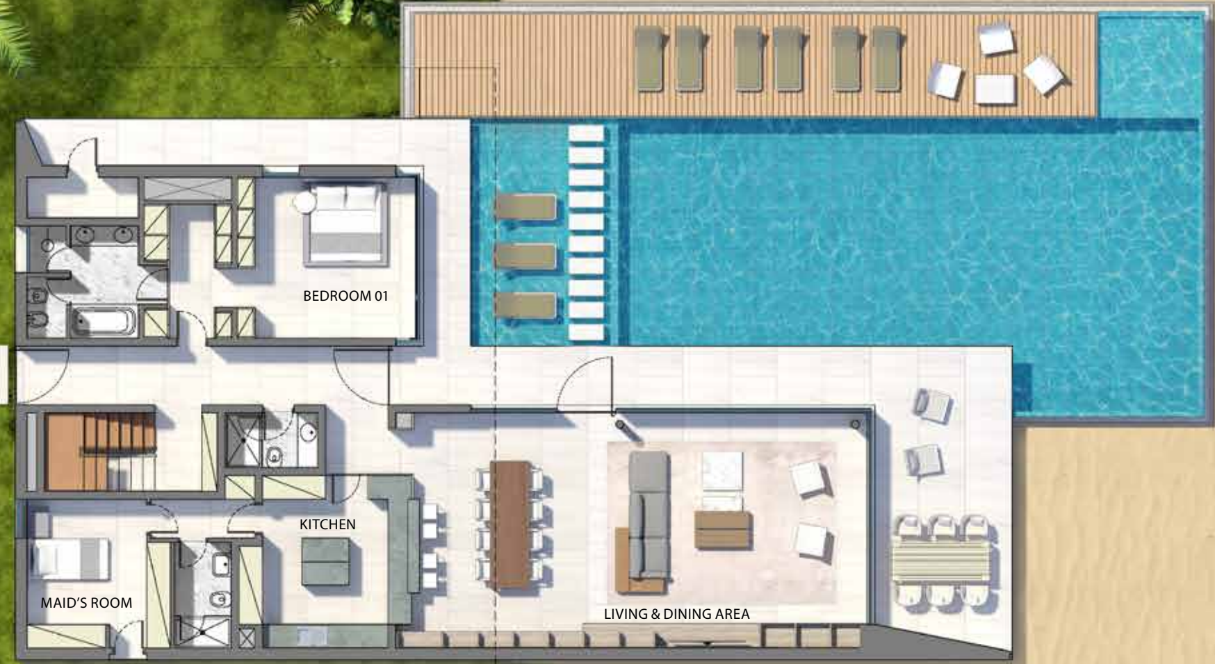
VILLA A GROUND FLOOR PLAN