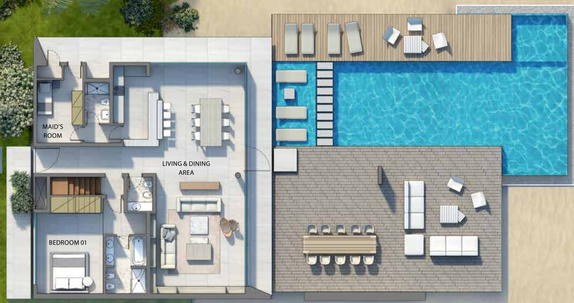
VILLA A1 GROUND FLOOR PLAN